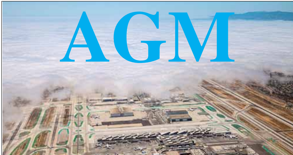
June gloom cloud layer rolling in over LAX