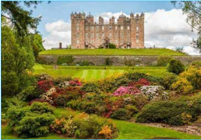
June bloom at Drumlanrig Castle near Thornhill

Royal Scottish Country Dance Society Los Angeles Branch