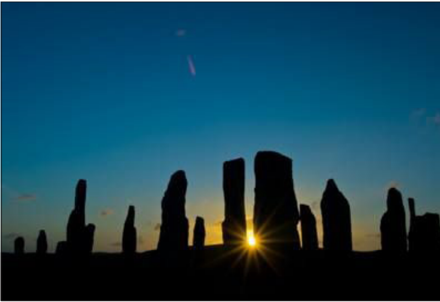
Summer solstice at the Callanish Standing Stones on Scotland's Isle of Lewis

Royal Scottish Country Dance Society Los Angeles Branch