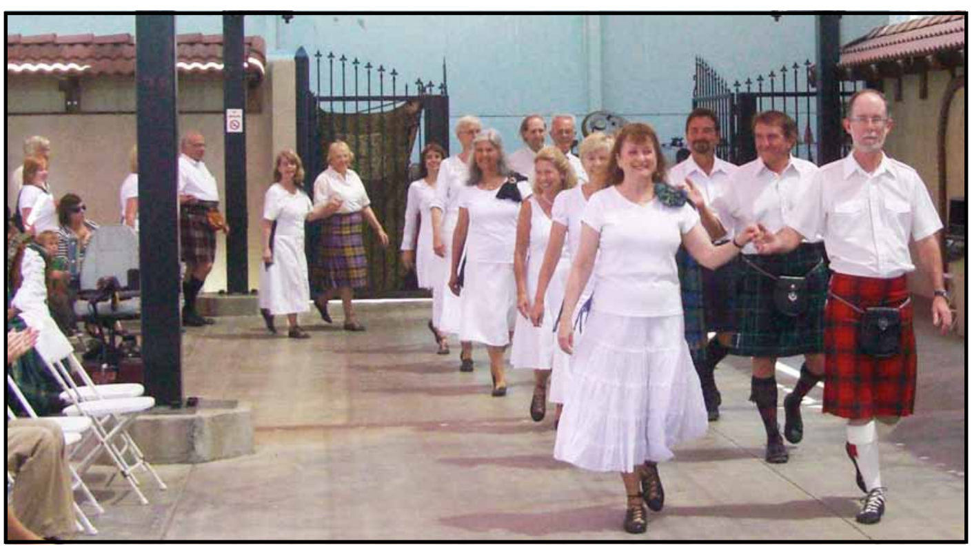
Dancers for the Sunday demonstration enter the stage area at the Costa Mesa Highland Games. GHILLIE CALLUM 3 September 2012