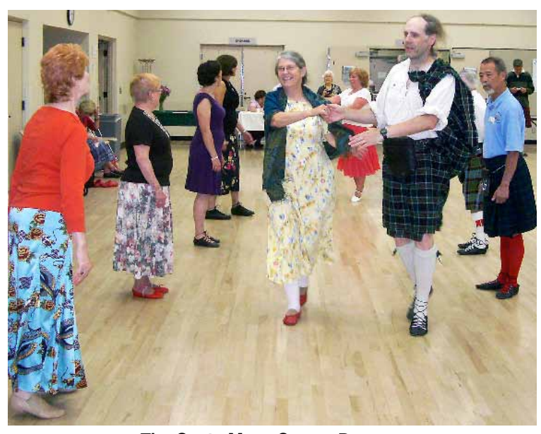
The Costa Mesa Games Dance