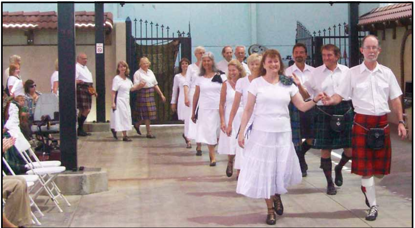
Dancers for the Sunday demonstration enter the stage area at the Costa Mesa Highland Games.