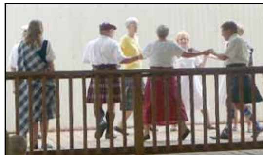
Members of the Long Beach class and friends put on a Scottish program, including SCD, for Cub Scout day camp in July.