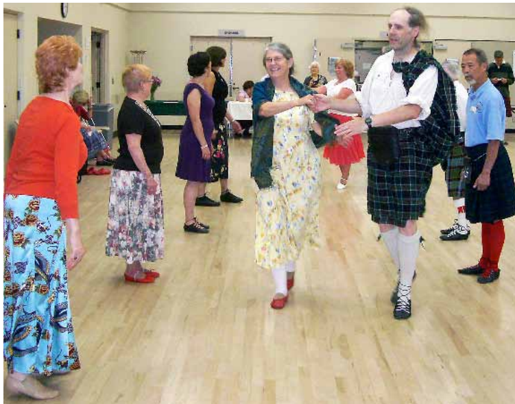
The Costa Mesa Games Dance