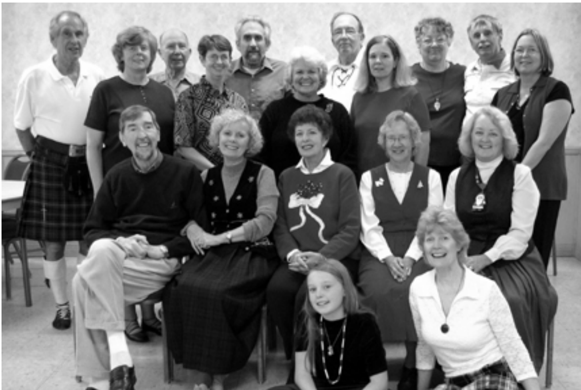
Manhattan Beach Class Christmas Party