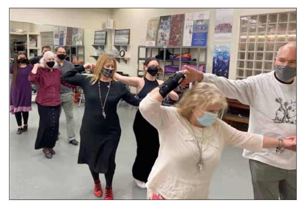
For the sake of new and returning (but rusty-from-two-years-off) dancers, the Santa Barbara class resumed with Scottish country dancing basics. Here, the class is dancing the knot.