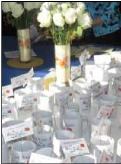
Souvenir anniversary mugs hold everyone's place cards.