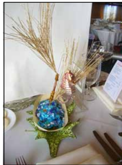
Centerpieces at the ball.