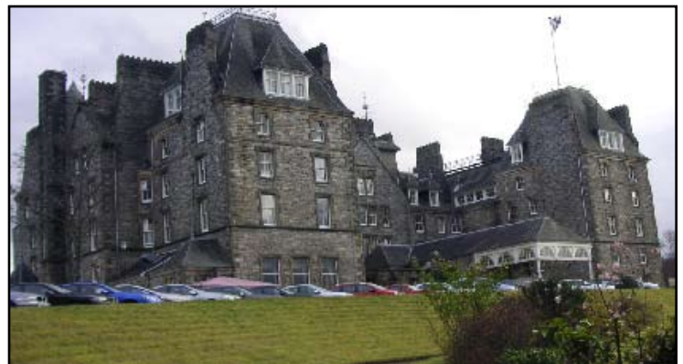
The Atholl Palace Hotel.