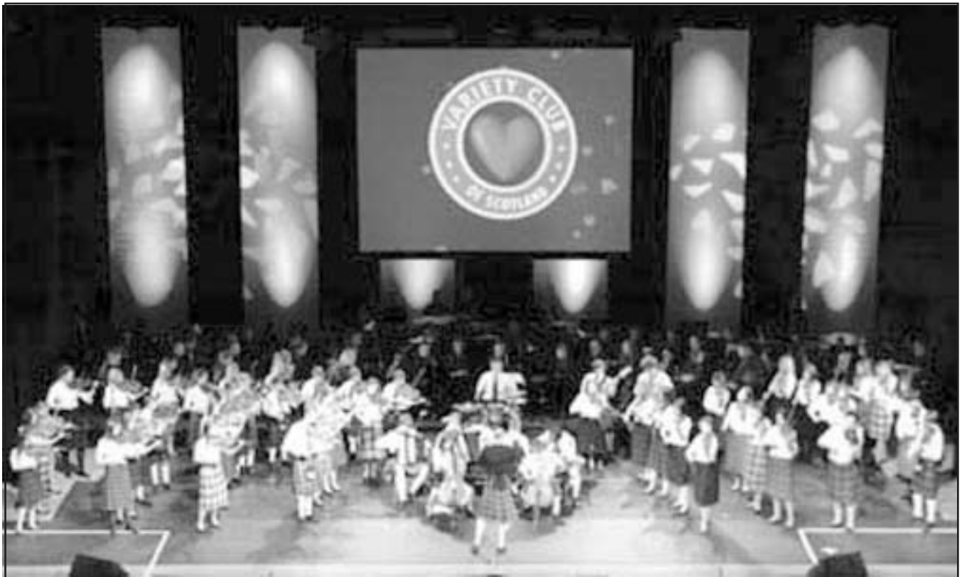
The Ayrshire Fiddle Orchestra (AFO) described in the article on the preceding page. (Two photos sent by fiddlers.)