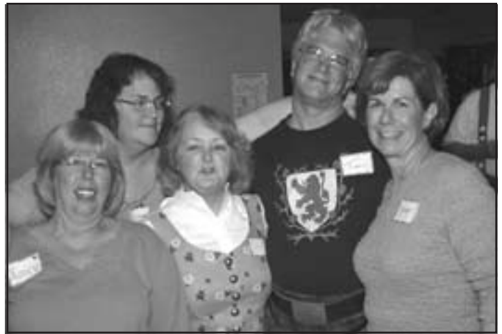
Photographs of Lomita and Torrance classes of St. Patrick's Day party at the Cultural Arts Torrance Center on March 17.