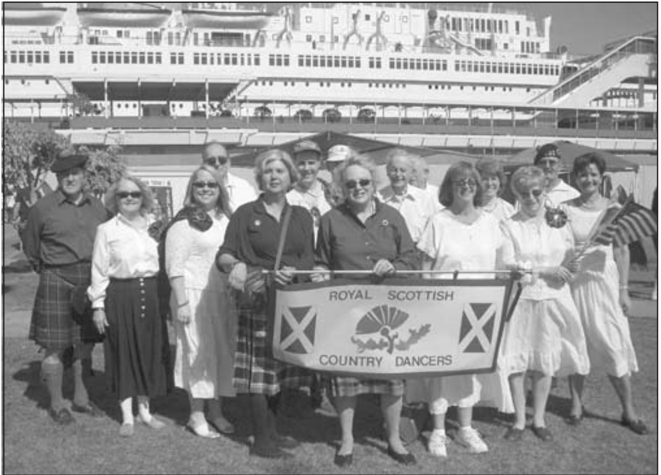
Members of the Los Angeles and Orange County branches participating in the clans parade and SCD demonstration at the Queen Mary on Feb. 17, 2007