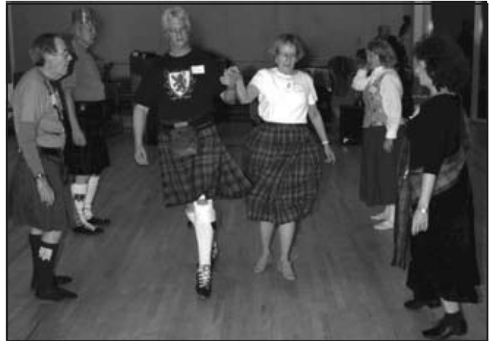
St. Patrick's Day Party held by Torrance & Lomita classes at Torrance Cultural Arts Center on March 17.

18 - 25 DANCE WEEKEND, PRAGUE - CZECH REPUBLIC. Registration and details: www.dvorana.cz or email: dvorana@dvorana.cz