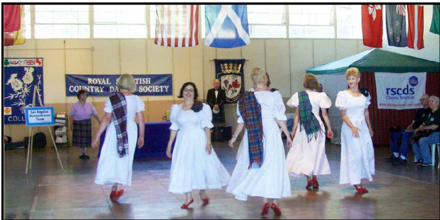
The Los Angeles Branch Demonstration Team performed twice on Saturday at the Seaside Highland Games.

9 OC Monthly Dance. Anaheim Downtown Community Center, 7:00 p.m. Music: recorded.