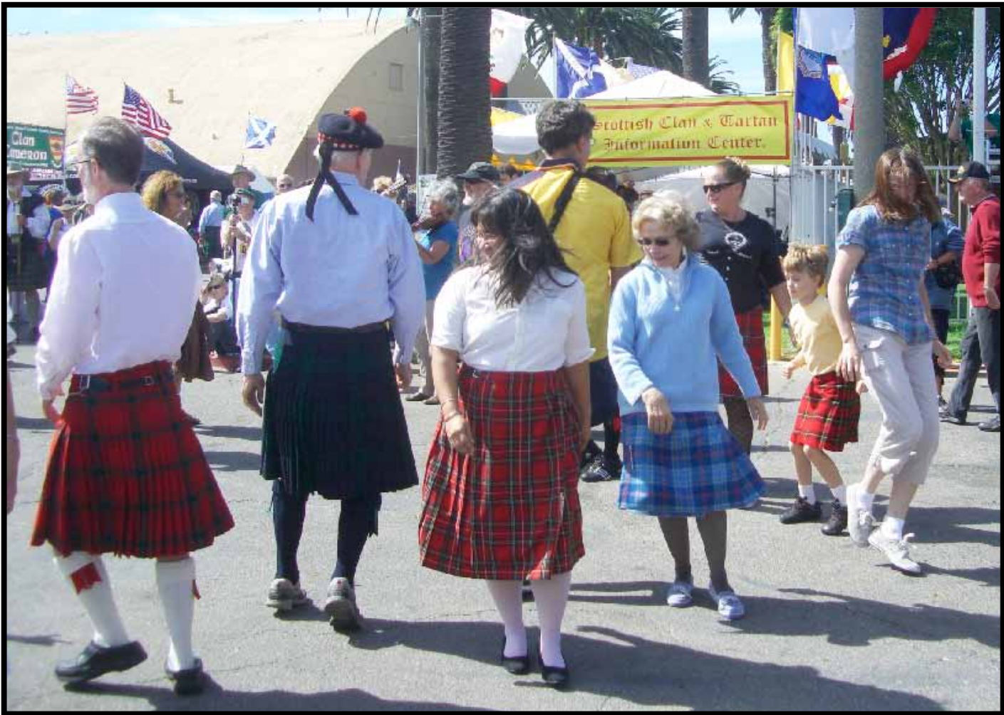
Scottish Country dancers are joined by some non-dancers in the “spontaneous” flash mob on Saturday at the Seaside Games.