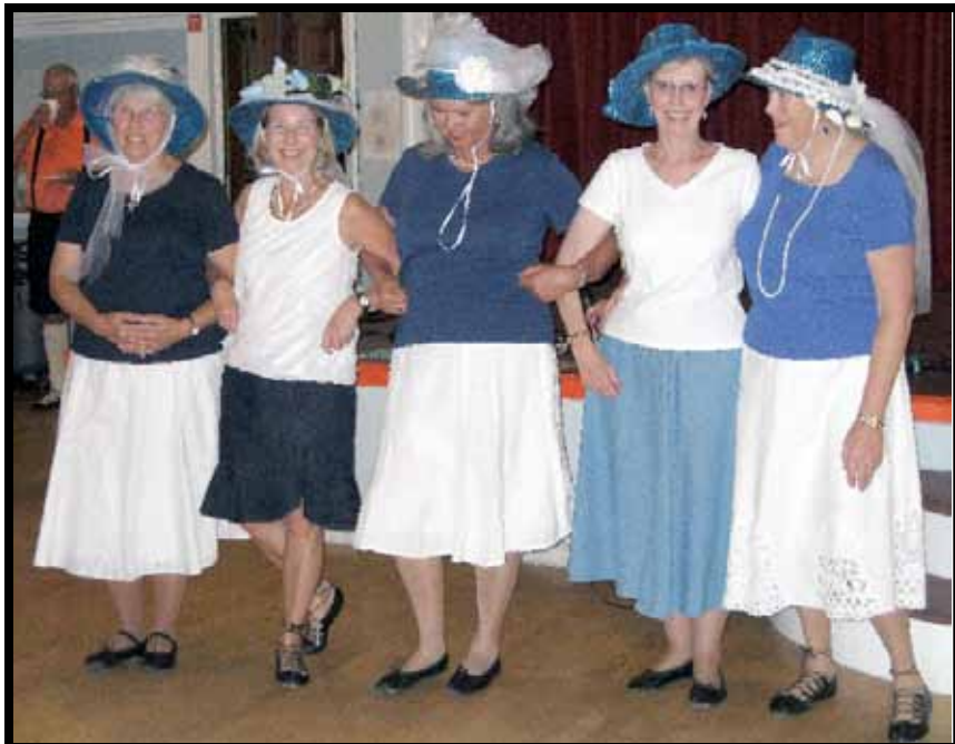
Blue Bonnets — such fetching chapeaux, carefully coordinated in Orange County.