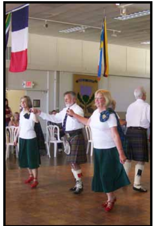
The Clan MacLeod Dancers performed twice on Sunday at Seaside.