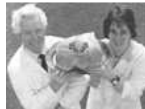
Scottish bakers with the Haggis